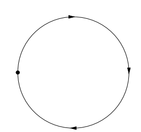
Figure 15.1: Consider a flow on a circle that moves clockwise everywhere except at a single rest point. This rest point is the unique \omega -limit point of the flow. Now suppose the flow represents the expected motion of some underlying stochastic process. If the stochastic process reaches the rest point, its expected motion is zero. Nevertheless, actual motion may occur with positive probability and in particular the process can jump past the rest point and begin another circuit. Therefore in the long run all regions of the circle are visited infinitely often. The long run behavior is captured by the notion of chain recurrence, as all points on the circle are chain recurrent under the flow.